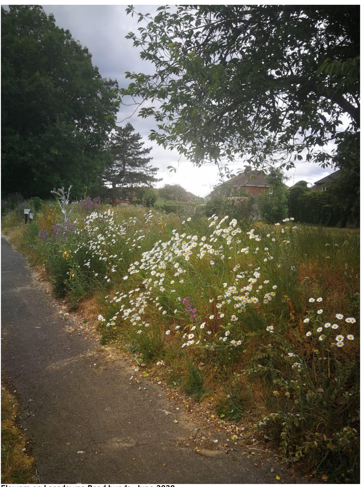
Flowers on Lansdowne Road bunds, June 2020