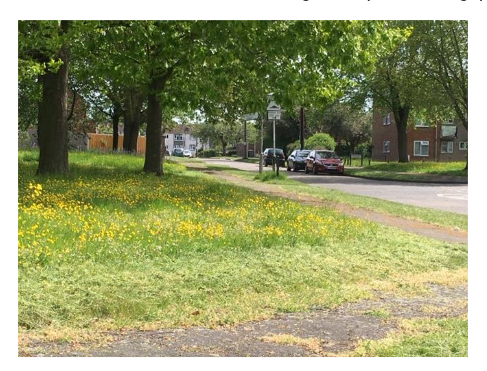
Virginia Way, between Coronation Square and Florian Gardens, May 2020

In terms of appearance, all areas looked colourful in the spring, as expected. Later in the season, the flowering of species other than grass was much less evident, with grass flowers and a few tough species like Achillea millefolium and Hypochaeris radicata dominating. The exceptions were sites like Lansdowne Road, where the bunds were seeded and there was a large variety of flowering species.