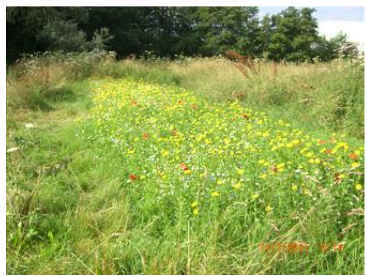
Waterloo Meadows, summer 2021

At Waterloo Meadows, the Friends of Waterloo Meadows and CROW (Conserve Reading on Wednesdays) worked together to extend the wildflower scrapes. Using funding donated by SUSTRANS for seed, volunteers have created several large areas of wildflowers, most near to the main path, going through the Meadows. The results in the middle of summer were spectacular.